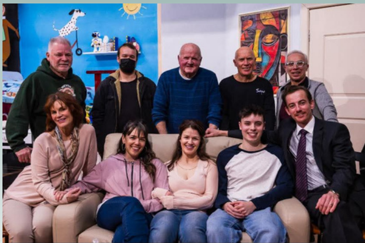
Rabbit Hole cast and crew.

Check out our website for more information.